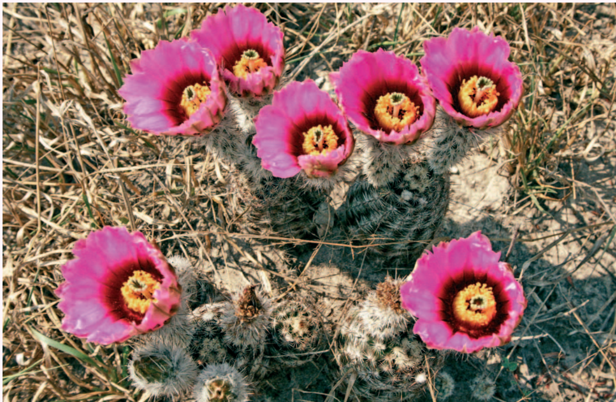
Fig. 13 Multiple flowers on Echinocereus fitchii ssp. albertii , overhead view of plant in Fig. 12