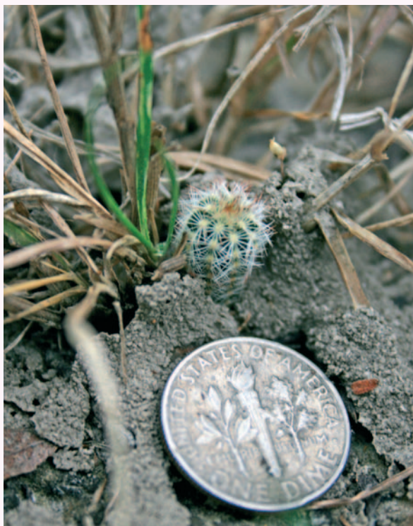
Fig. 8 Juvenile Echinocereus fitchii ssp. albertii thriving in ant-generated soil

areoles below and above, hiding most of the stem of the plant. Only where radial spines met radials from adjacent ribs could any of the stem be seen. Noticeably, each areole had several central spines, some of which were tipped brown (Fig. 2). Three days later we resumed our search for E. fitchii ssp. fitchii at another location but in the meantime our thoughts turned to the following day.