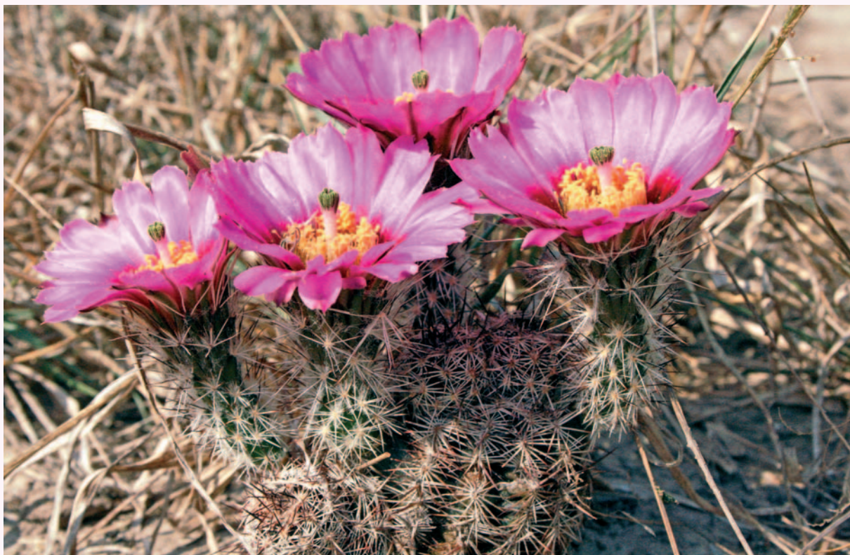
Fig. 14 Echinocereus fitchii ssp. albertii – adding colour to the desert