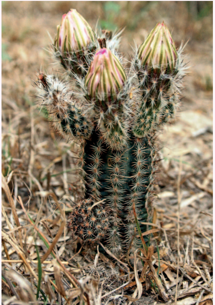
Fig. 10 (right) Strong central spines on Echinocereus fitchii ssp. albertii in Kleberg County