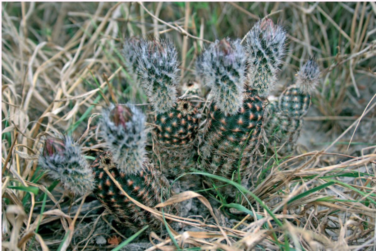
Fig. 7 The dark, easily visible stems of Echinocereus fitchii ssp. albertii