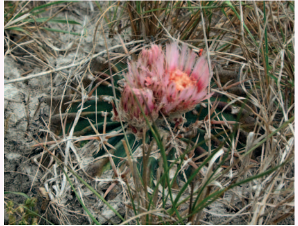
Fig. 4 Echinocactus texensis , Refugio County

Blum and Lange (1998: 313 [1998 preprint: 5]) used Benson's epithet to create E. fitchii ssp. albertii . Actually they had a free and equal choice of epithet in the new rank and could have equally well recombined E. melanocentrus , but they believed erroneously that Backeberg's name was invalidly published.