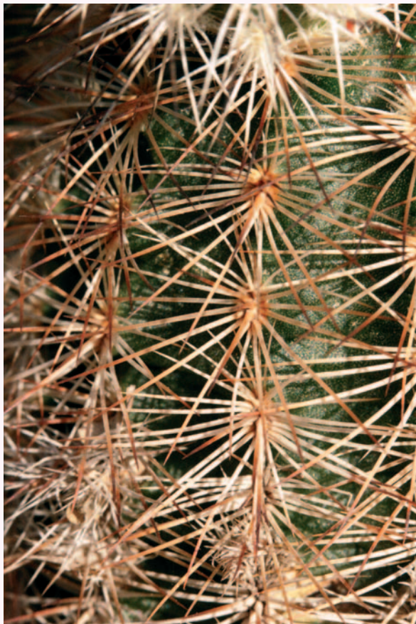
Fig. 19 Clusters of central spines on Echinocereus fitchii ssp. fitchii

Early the next day we had arranged to meet Kim Wahl (Plant Ecologist, USFWS) at Santa Ana National Wildlife Refuge (NWR), who had agreed to escort us onto some USFWS-managed land in the Lower Rio Grande Valley. This was some two hours drive from where she was based. Our objective was to find some more examples of E. fitchii ssp. fitchii for comparison with E. fitchii ssp. albertii . Again, we agreed not to divulge the exact location. The sun shone as we arrived, and we started to pick our way through the shrubs.