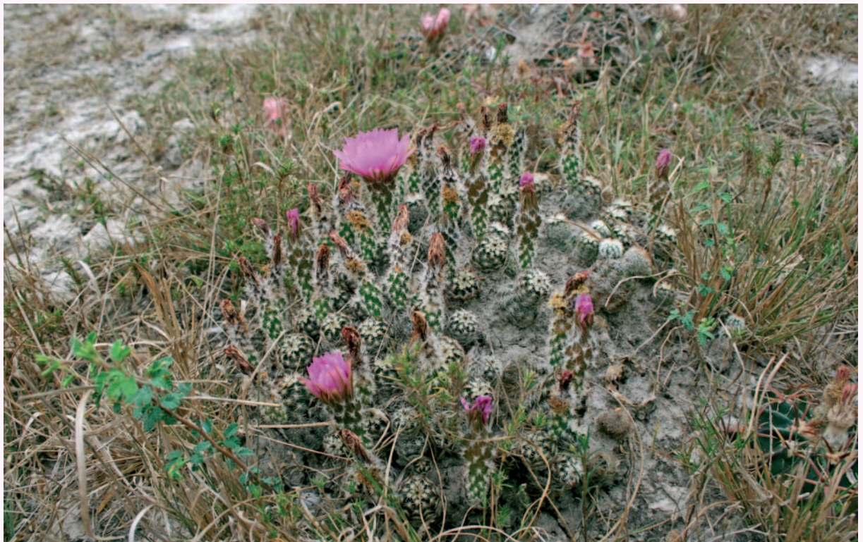
Fig. 6 Echinocereus fitchii ssp. albertii losing ground to fire ants