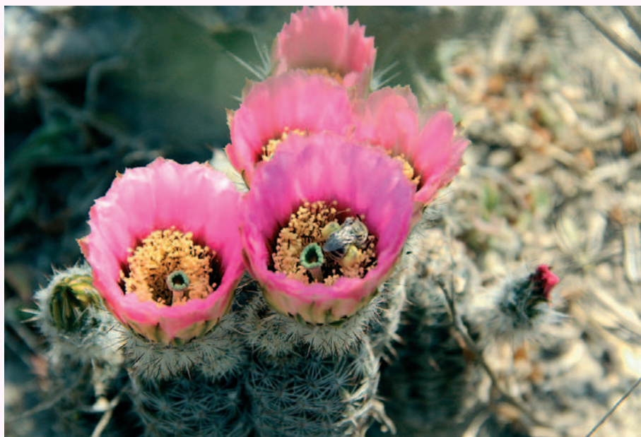
Fig. 16 A bee pollinating Echinocereus fitchii ssp. albertii

Remembering the E. fitchii ssp. fitchii that we had seen only a day ago, the plants here were very different and on many the dark stem was visible not only between the ribs but even between the areoles above and below (Fig. 7). In marked contrast to ssp. fitchii most of the plants on this site showed little evidence of a central spine or if it existed it was fairly weak. The tips of