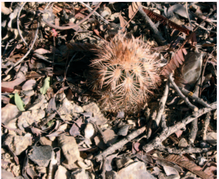
Fig. 18 Young Echinocereus fitchii ssp. fitchii