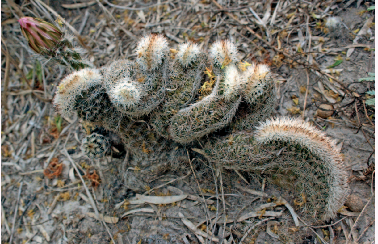
Fig. 11 Cristate form of Echinocereus fitchii ssp. albertii