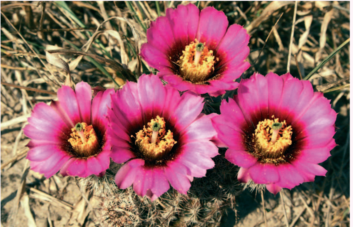
Fig. 12 Multiple flowers on Echinocereus fitchii ssp. albertii