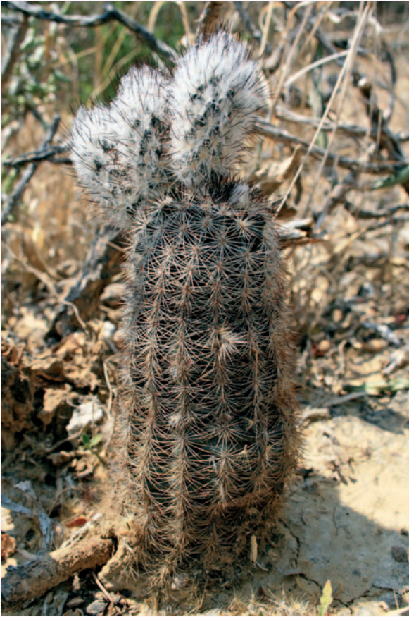
Fig. 2 Echinocereus fitchii ssp. fitchii north of Laredo