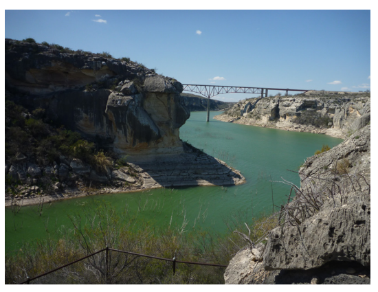
4. View from the White Shaman rock shelter, looking over the Pecos River near Comstock, Texas.

Further evidence that the Plains-style peyote ceremony was adapted from an earlier Coahuiltecan ceremonial form can be found in traditional NAC peyote songs. Songs sung during NAC ceremonies frequently contain vocables, "sequences of syllables that do not appear to be real words" (Aceves & Garza 2010: 2), but which are recognized as having some long-lost meaning. Within the NAC, there are four required songs that are sung by all Roadmen (NAC ceremonial leaders), regardless of tribal affiliation, and vocables in three of these songs have been demonstrated to phonetically parallel words in the Coahuilteco and Comecrudo languages of South Texas (Aceves & Garza 2010). For example, the Coahuiltecan phrase xanē yohui (pron: hey-ney-yo-way), meaning "with all that I am," is frequently used to close a phrase or refrain in peyote songs (Aceves & Garza 2010: 2). The presence of these linguistic artifacts in these obligatory ceremonial songs, is strongly suggestive of a historic