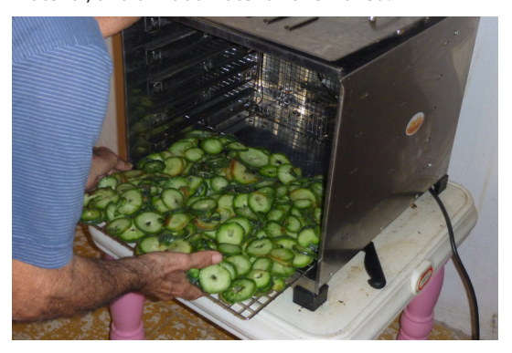
11. Morales loading the dehydrator.