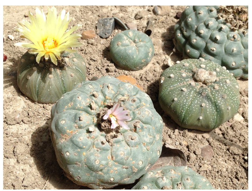
15. Peyote and star peyote blooming side by side in a peyotero's home garden.

whole dried buttons. This difference in preference occasionally leads to misunderstandings. The peyote market has traditionally sold peyote by the thousand, and customers could count their purchases to ensure they received what they paid for. With dry sliced buttons it is no longer possible to count the number of buttons sold, and some distributors have been accused of selling dried peyote at a thousand slices rather than a thousand buttons. However, no set of one thousand buttons is created equal. Depending on size, a thousand fresh buttons could weigh anywhere between 80 and 100 lbs. While Morales used to count out batches of 1000 buttons to dry, eventually he came up with a standardized weight for dried peyote based on a batch of 1000 peyotes of mixed sizes. This way he is able to produce and provide a consistent product for his customers.