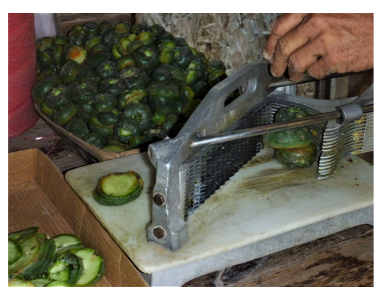
10. Mauro Morales using a commercial vegetable slicer to prepare peyote for dehydration.