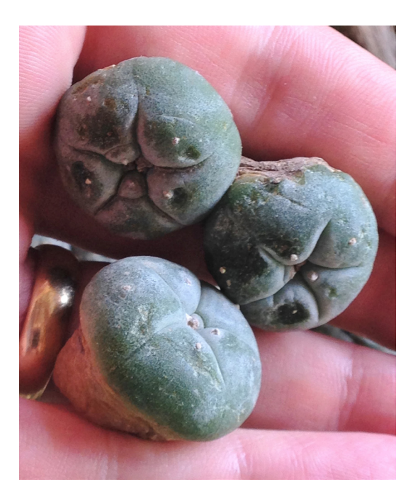
Harvested peyote buttons found for sale in Texas. Each is about 1 inch in diameter.

Texas to learn about the history of the trade, their business practices, and some of the current challenges they face. During this time I learned some of the tricks of the trade, including how peyote should be harvested and stored, how peyote is bought and sold, as well as learning about the relationships between peyoteros and their Native American customers, and some history on local folk uses of peyote.