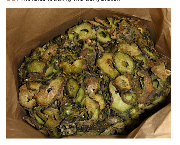
13. Bag of dried peyote slices retaining a relatively vibrant and fresh appearance.