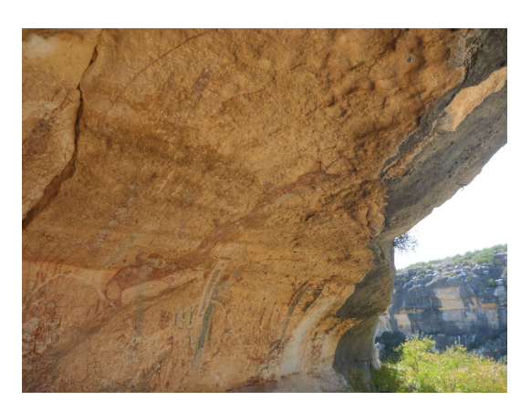
3. View of the arching surface of the White Shaman Mural, and looking out from within the rock shelter.

hides for a tipi. His description of the early Lipan Apache pevote ceremony suggests a transitional ceremonial format, somewhere between the Mexican and current Plains pevote complexes. The introduction of the tipi was a major departure from the Carrizo ceremony, and no food or water was allowed in the tipi. Women were not allowed to participate, as they were among the Carrizo. A large peyote button was also set to the west of the fire, but no altar was constructed. The altar was apparently introduced later and is now a core feature of the Plains complex. This early Lipan Apache ceremony included a ceremonial leader, who sat to the west of the fire, a fire tender who sat to the east, next to the door, and a drummer who would travel around the tipi to accompany the singers. Individuals could get up and dance if they felt so inclined, a practice which appears to be a carry-over from the Carrizo, but which is unusual in the Plains complex.