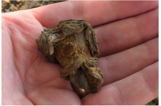
14. Sun-dried peyote.

shrivel and turn a dirty dark green color. The process could be completed in 8–10 hours, and didn't depend on the weather; another advantage. While Morales used to pay his pickers to slice each button by hand he eventually adopted a commercial vegetable slicer to produce more uniform slices and save time (Fig. 9–14).