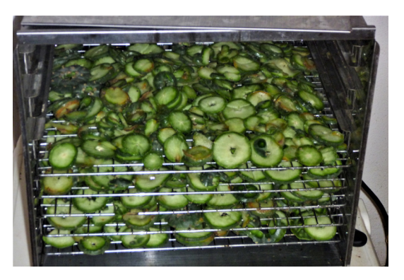
12. A food dehydrator can fully desiccate sliced peyote within 8 hours, a process that may take days or weeks by sunlight.