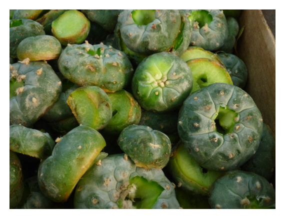
9. Before slicing peyote for the dehydrator each button is cored, removing tufts and harder to digest material, and all root material is removed.